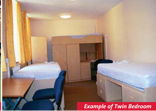
Example of Twin Bedroom