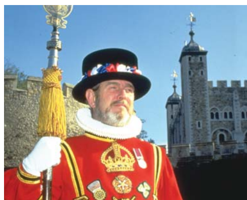
Beefeater at the Tower of London.

Whitgift enjoys a beautiful parkland site – there have been peacocks at Whitgift since the 1930's. They have been joined by white