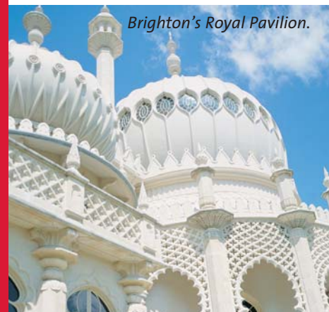
Brighton's Royal Pavilion.