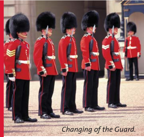
Changing of the Guard.

** Please note – programme is sample only and may change.