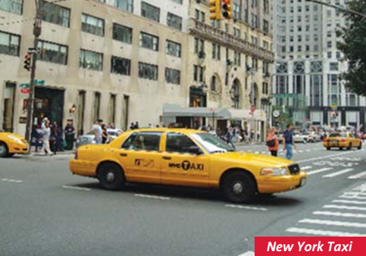
New York Taxi